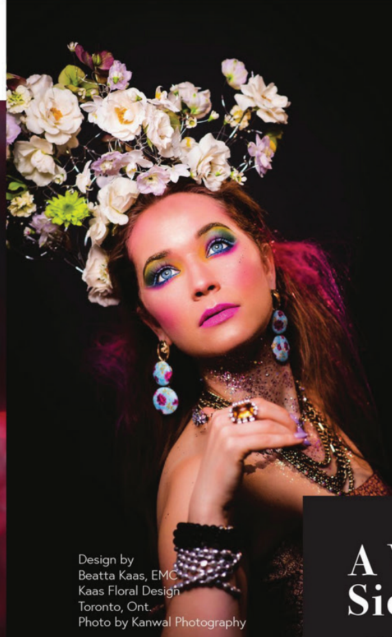
Design by Beatta Kaas, EMC Kaas Floral Design Toronto, Ont.