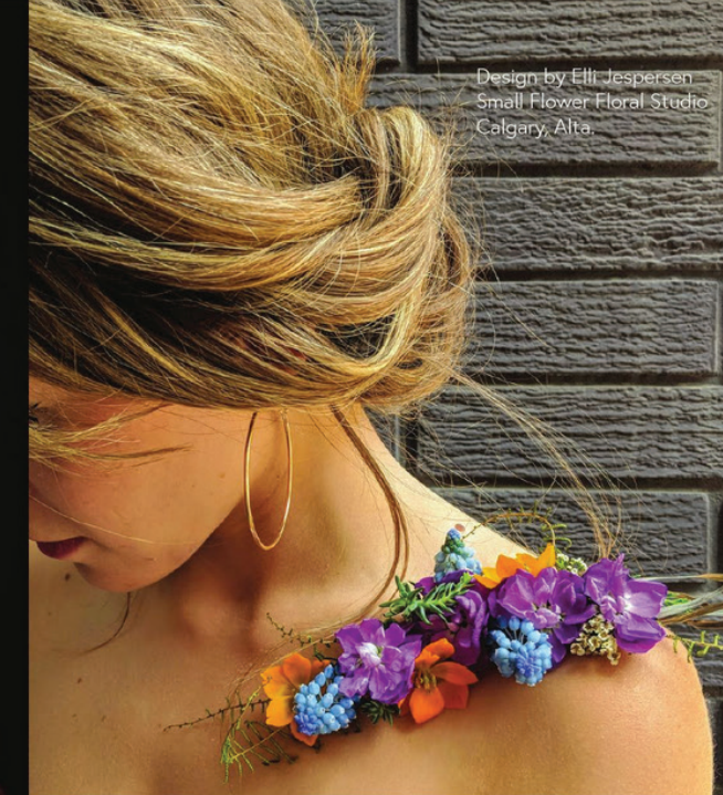
Design by Elli Jespersen Small Flower Floral Studio Calgary, Alta.