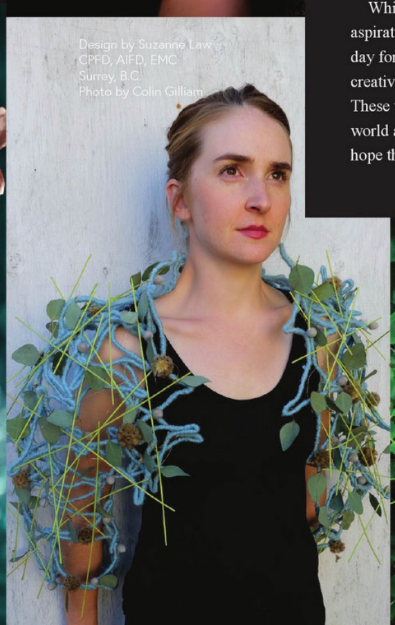
Design by Suzanne Law CPFD, AIFD, EMC Surrey, B.C.

While large-scale or elaborate floral wearables are inspirational and aspirational, more practical, salable flowers to wear are the order of the day for most floral designers. With this section, we want to inspire your creativity with designs that spark your inner floral-fashion designer. These wearable florals from designers across the U.S. and around the world are beautiful and creative as well as functional and salable. We hope they inspire you to create something amazing for your clientele.